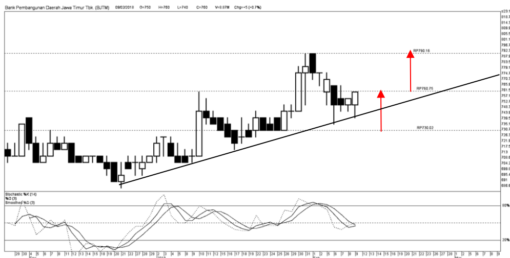
Kinerja saham BJTM

Danareksa research report are also available at Reuters Muxet and First Call Direct and Bloomberg